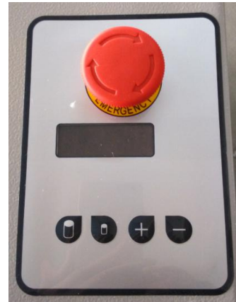
Safety inspection switch for door